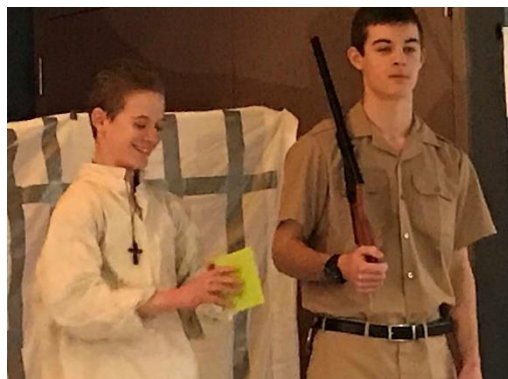
Fr. Kentenich receives the letter with joy and prepares his response to his wonderful Schoenstatt family on the outside.