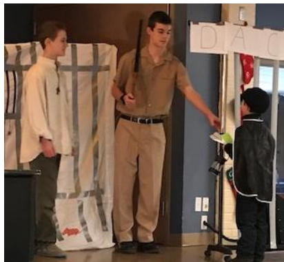
The messenger delivers the letter to the prison guard, whom Fr. Kentenich had befriended while in Dachau.