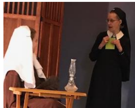
Mother Superior receives the letter from Sr. Mariengard and calls for her messenger to deliver it to Fr. Kentenich.